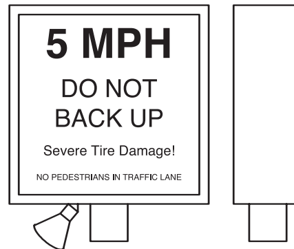
Warning Sign: 24" H x 24" W x 8" D 61cm W x 61cm H x 20.3cm D