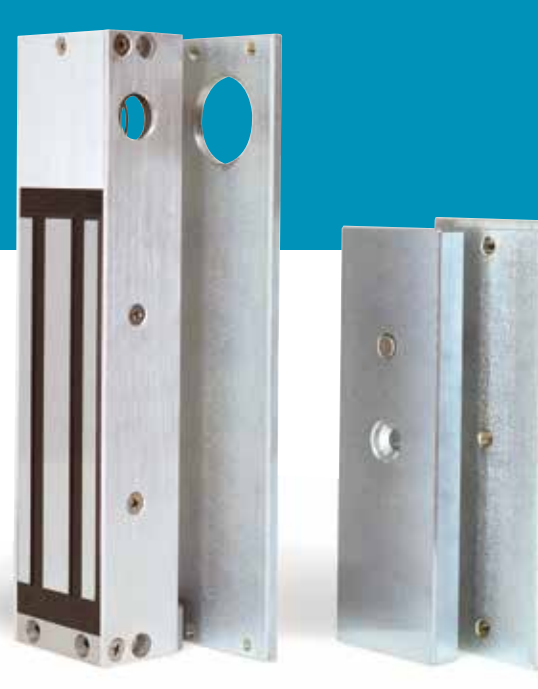
DKGL-S12 1200 Lb Maglock and Armature with Welding Mounting Brackets

DKGL Single Gates 600 and 1200 Lb lock strength