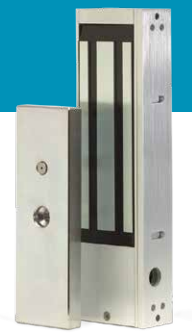
DKML-S12 1200 Lb Armature and Maglock

DKML Single and Double Doors 300, 600, 1200, and 2000